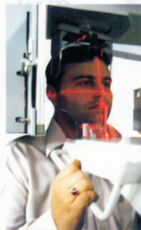
Sharp, Sleek Red Cross-Beam for Precise and accurate Positioning

Power Supply 230 V/50 Hz Nominal Power 630 Watt Max. Line Current 5 Amp. Max. Power 1100 Watt Displacement 100 cm. Console/Generator Touch Panel, Two Line alphanumeric LCD Display, Two Pulse X-ray Generator